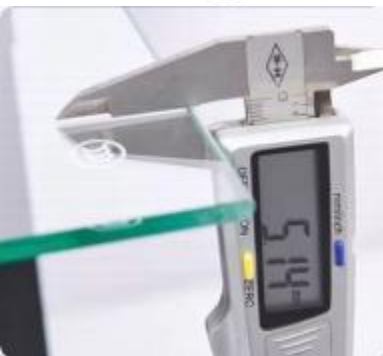
5mm Toughened glass