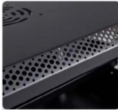
Top ventilation mesh