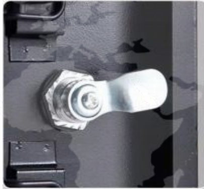
Small round stainless lock