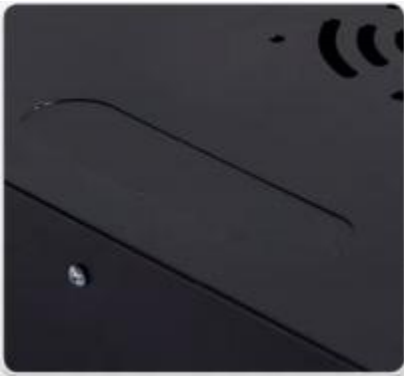
Knockable cable entry on the top