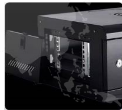
Removable side door